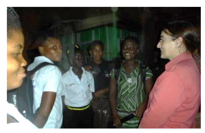
referral booklets, as well as condoms and lubricant for sale. The torch is crucial since the neighborhood was completely dark.

PEs are also commercial sex workers and are thus very knowledgeable about the conditions, problems and concerns of FSWs. They informed the team that a FSW, while having good and bad days, can make on average 100 GHC a day, which explains why revenue generating activities have limited potential to replace sex work in the long run.